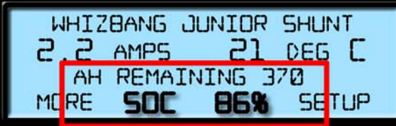
Whizbang Jr. - Actual Size